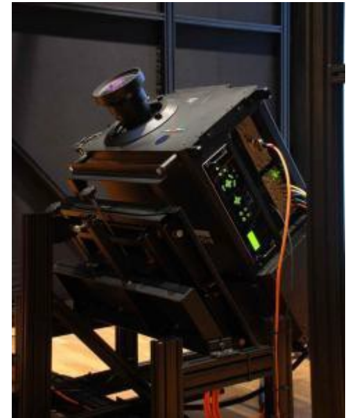
Digital Projection HIGHlite 8000Dsx projection system (4 projectors).